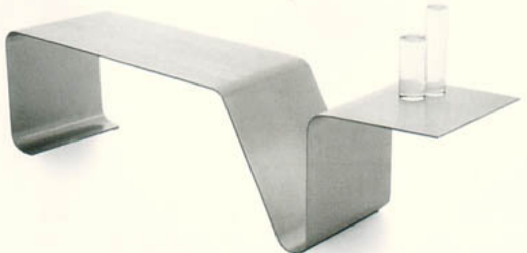
▽ Ilkka Suppanen, Game-shelf table for Snowcrash, 1999